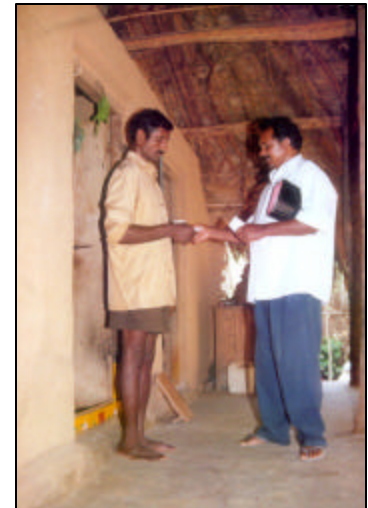
Above: door to door witnessing and passing out tracts

No one is awaiting baptisms. Because after the preaching service, if anyone accepts Christ, then we take them to the lake or river or stream in that village and baptize them. So generally we will not keep people waiting for baptisms.