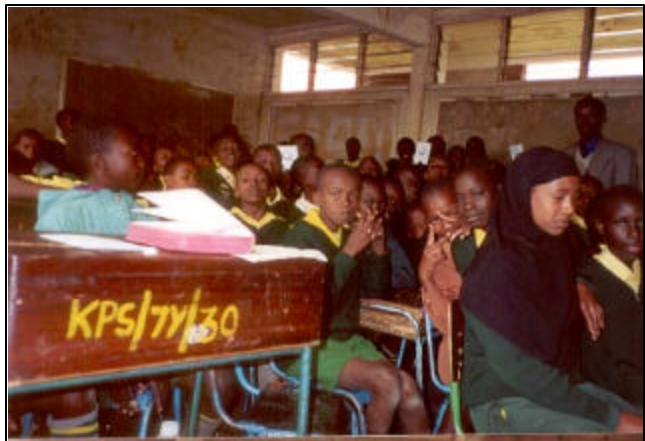
Witnessing to a class at the Kaloleni Public school in Nairobi, Kenya. Notice the Moslem girl in the front. July 29, 2003