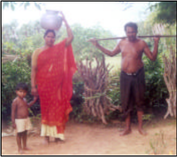
Above: gathering sticks to sell for earning a living before sponsorship began

Sometimes they used to sell the firewood and other material brought by themselves to the village people. With such small sums made, they barely survived. The children also used to help in gathering sticks and branches to be used as firewood. At that