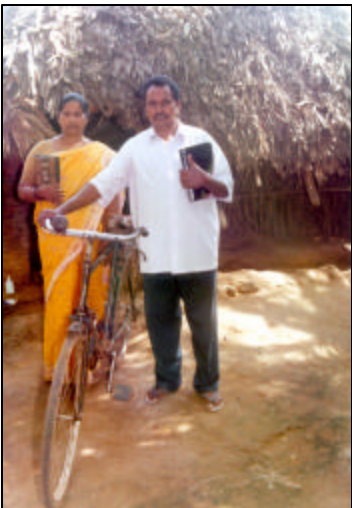
Below: with sponsorship, they now have clothes and a bicycle for ministry. Their house is in the background.