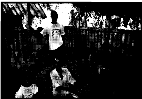
Kindergarten class and teacher inside the sparse class room.

The tour took all of 5 minutes. The kitchen is about 15 x 15. A bamboo roof with mud walls. I asked Richard where the money