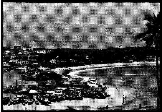
The orphanage is located 10 miles from the Coastal village of Elmina.

phans and let God lead you concerning how to respond.